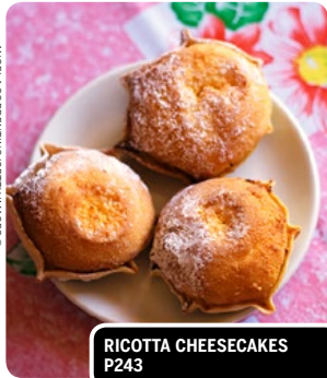
RICOTTA CHEESECAKES P243