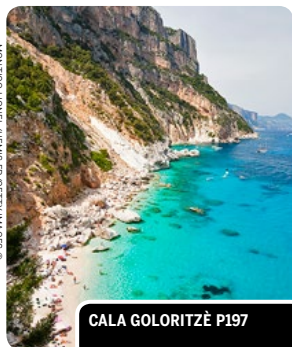
CALA GOLORITZÈ P197